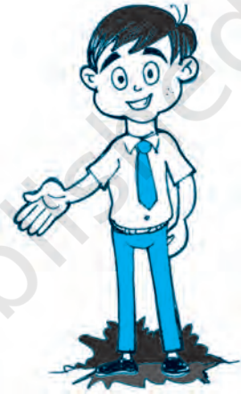
This group is very much like the people of my village.

for all their diversity, this group has to live together. They are dependent upon each other in various ways. They require the cooperation of each other. What will enable the group to live together peacefully?