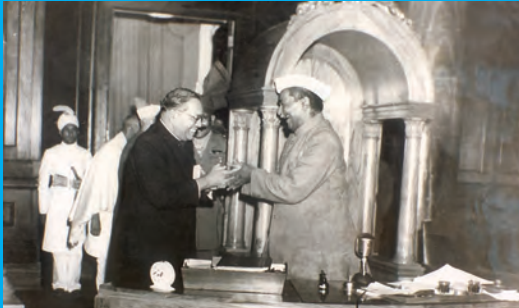
The President of the Constituent Assembly, Dr. Rajendra Prasad and the Chairman of the Drafting Committee, Dr. B.R. Ambedkar greeting each other

Constituent Assembly, where each clause of the Constitution was subjected to scrutiny and debate, is a tribute to public reason at its best. These debates deserved to be memorialised as one of the most significant chapters in the history of constitution making, equal in importance to the French and American revolutions.