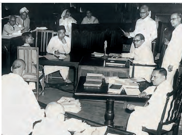
Dr. B.R. Ambedkar presiding over a discussion in the Constituent Assembly

Dr. B.R. Ambedkar CAD, Vol. VII, p.37, 4 November 1948